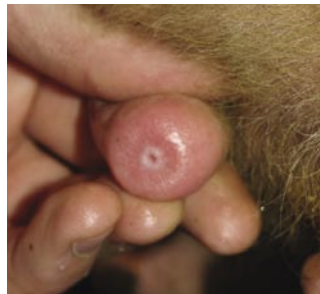
End result of exfoliation, healthy teat condition

shows improved skin hydration. Field experience echoes the lab results. Furthermore, one can design a pH 5 iodine teat dip that can be very harsh to skin. Therefore, it is difficult to make broad cause-and-effect generalizations on pH.