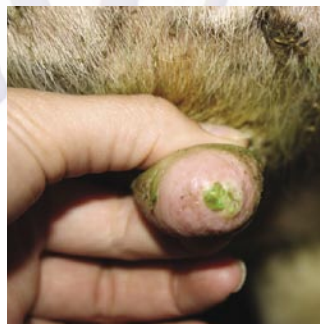
Teat exfoliation as a result of ABS udder care products

There are claims that low pH is bad while products with moderate pH (pH about 5 or 6) are more desirable for skin. These generalizations about pH are not accurate. It is recognized that a strong acid can be corrosive to skin; however, not all acidic products are bad for skin. Chlorine dioxide products, with pH levels ranging from 2.7 to 3.2, are proof. Lab testing of these products